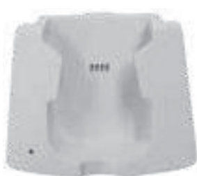
EBI 20-IF Interface