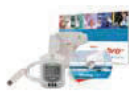
EBI 20-TH1-Set Temperature Humidity Logger Set (Logger, Evaluation software, Interface)