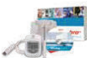
EBI 20-TE1-Set Temperature logger set (logger with external probe, evaluation software, interface)