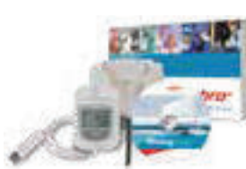
EBI 20-TF-Set Temperature logger set (logger with external probe up to +100 °C (+212 °F), evaluation software, interface)