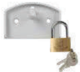
EBI 20-WM wall bracket