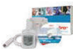
EBI 20-T1-Set Temperature logger set (temperature logger, evaluation software, interface)