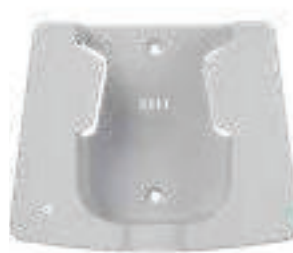
EBI 20-WM-1 truck wall bracket