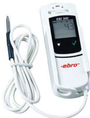
EBI 300 TE + EBI 300 WM2