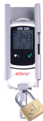
EBI 300 WM3 transportation mount for EBI 300/310 made of stainless steel