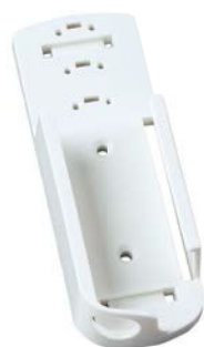
EBI 300-WM2 Wall Mount for EBI 300 / 310