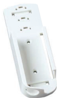
EBI 300-WM2 Wall Mount for EBI 300 / 310