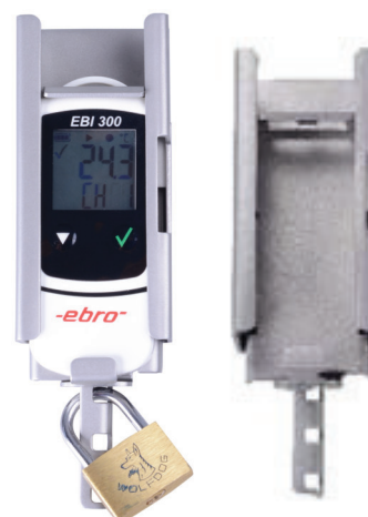
EBI 300 WM3 transportation mount for EBI 300/310 made of stainless steel